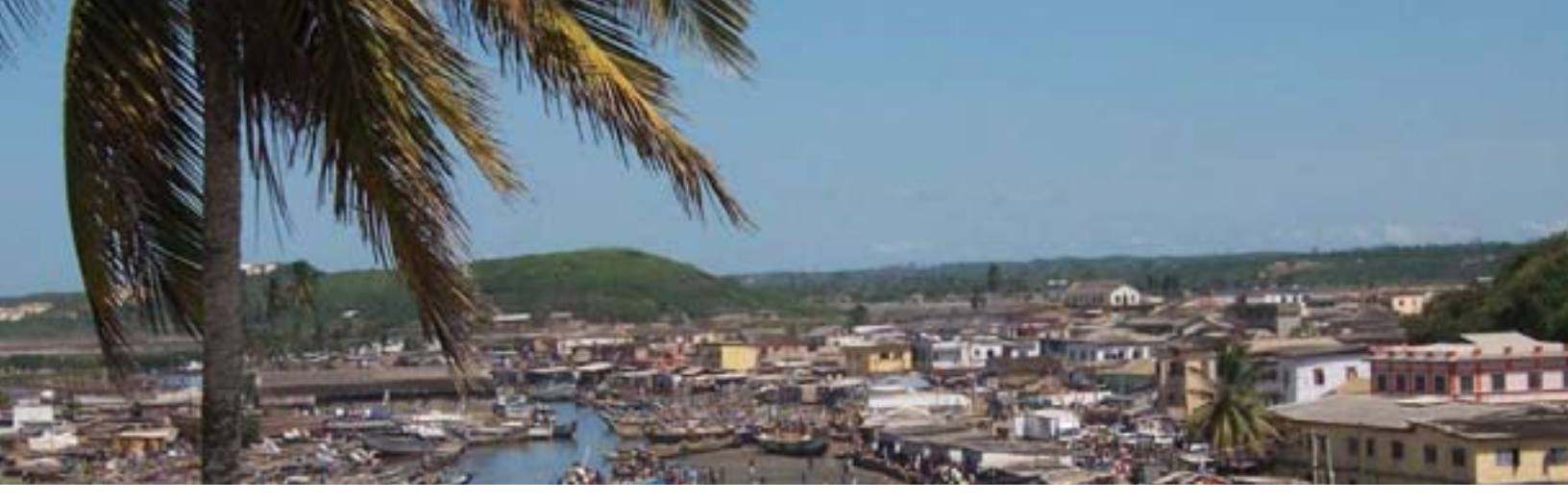
Ghanaian fishing villiage.

different...just a little less worse than in the castle. We know it wasn't. But it was this hope that sustained and nourished their souls during the middle passage and as they were scattered throughout the Americas and the Caribbean, from Brazil to Barbados, from Mississippi to Missouri. It is this hope that made millions of Africa's sons and daughters survive and rise up again on lands unknown to those who went through this door of no return...door of sorrow and hope.